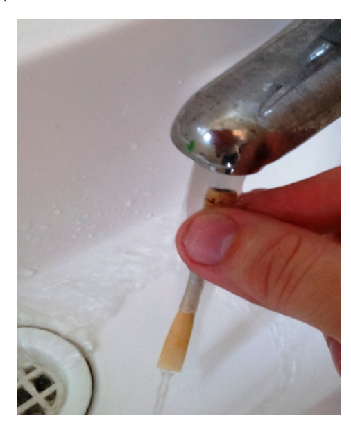
Oboe Plaque/Sand Paper

Place your reed (staple end up) under a fast flowing water tap, this will push out any small particles (such as your lunch!) Do this regularly to keep the reed fresh.